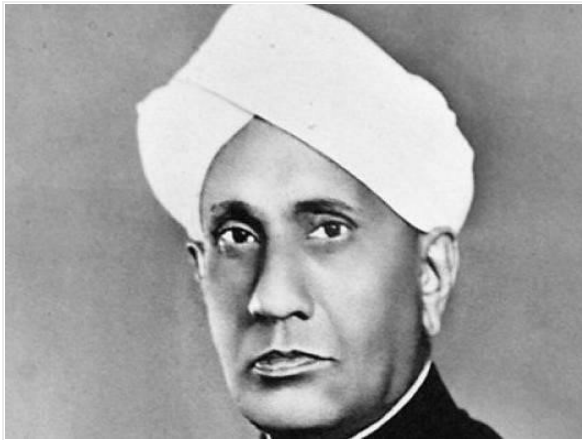
Beautiful mind Sir CV Raman

On World Wi-Fi Day, the villages from which two of India's Nobel Laureates hail will get connected